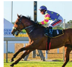
Foreign Source