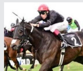
Bouclette