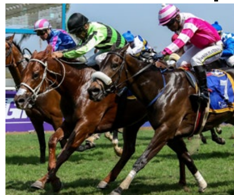
Africadia (green silks) | Candiese Marnewick

A total of 21 entries were received last Friday for this year's R1-million Emperors Palace Ready To Run Cup to be run over 1400m at Turffontein on Saturday, 2 November.