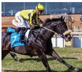
Seventh Gear